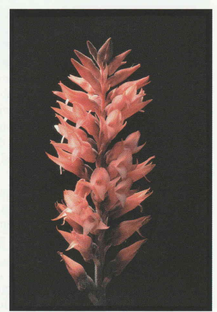
Sacoila lanceolata var paludicola

road was made after WW2 to take out all the bald cypress - a much-valued tree. The highway was then cut up into tramways to allow the trees to be felled and moved. My first visit did not yield a single orchid so, when I found out that they now have conducted swamp walks through the sub-tramways, I was on the phone and email to book myself a place. I was interested to see where all these orchids hide. This was not as easy as it sounds, since they never answered my emails nor returned my messages on the answer phone. The rangers are extremely busy, as they have to look after an enormous number of acres. This year I thought I was in luck as I got through on the phone and asked whether there were any walks during March, when I would be in Florida. The reply was - 'yes, one only but it was all full.' After my tale of woe they agreed that I could come down, as there would surely be a cancellation.