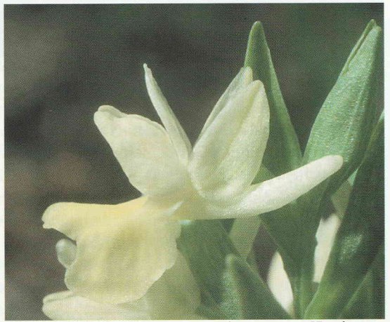
Dactylorhiza markusii

Cefalu is a popular seaside town mid-way along the northern coast, built around a huge fortified rock. From here our first destination was the Ficuzza Forest, much further west, being a few miles inland from Palermo. The forest is mainly of deciduous oaks. sparcely spread in places, on the northern slopes of a spectacular rocky mountain ridge. In places Cyclamen repandum spread a red carpet around us, but we were too early for the best display of White Peonies,