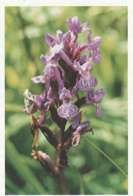
D. pulchella x G .borealis

"If you go down in the woods today, you are sure of a big surprise" as the Teddy Bears' Picnic goes, especially if it's the Oasis Holiday Village at Whinfell Forest, east of Penrith. Despite the Cumbria Wildlife Trust objecting, the holiday village was built in an area of pine forest which is believed to be a