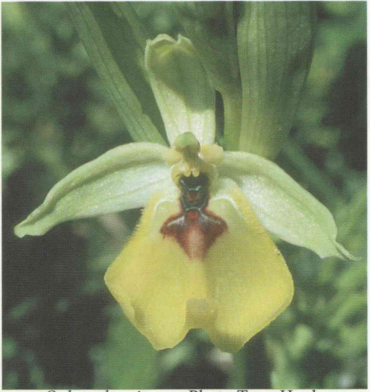
Ophrys lacaitae

replaced, such is the value of tourism So we descended towards Ragalna, where the much older lava flows were well weathered and clothed in vegetation. Here were hundreds of Orchis brancifortii, closely related to O. quadripunctata, and endemic to Sicily and Sardinia - a wonderful sight. Our next puzzle arose in a well-established wood of Oak. Spanish Chestnut and Etna Broom, where numerous bewildering Dactvlorhizas were just opening. Colours ranged from deep purple to pale yellow, with many intermediate shades of pink, orange and buff, and all the flowers had very long downcurved spurs. These were the