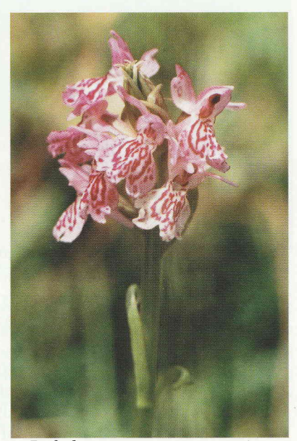
D. fuchsii x incarnata ssp. coccinea Hodbarrow Reserve.

The Dune Helleborine of the dune slacks has another variety, which Derek Turner-Ettlinger calls the North-eastern form from its locations in the Tyne valley and Holy Island. This variety has recently (2002) been found growing by the side of a disused mineral railway line in the suburbs of Carlisle. These plants tend to lack the pink tinge of the true dune plants.