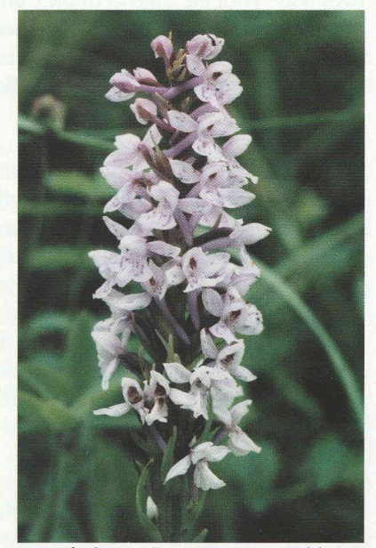
D. fuchsii x G. conopsea at Waitby Greenriggs reserve.

Gowk Bank NNR, managed by English Nature, is a fine example of an upland hay meadow, hay being cut at the end of the summer with light grazing during the winter. Little Asby Inrakes & Outrakes, an SSSI, is an example of village common land at a lower altitude on the south side of the Eden valley. Waitby Greenriggs reserve, where I am Hon. Manager, is an example of unimproved calcareous grassland. Controlled sheep grazing is carried out in the autumn to maintain the grassland in prime condition for its botanical interest.