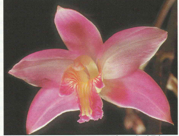
Bletia purpurea - the Pine Pink

Here it was in its cleistogamous form. We also saw Cyrtopodium punctatum the Cow-horn Orchid - but from quite a distance as it was growing on top of a tree. Luckily, we did see this at eye