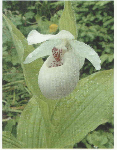
"Ulla Silkens" ( reginae x flavum )

or merges with macranthos in the Manchuria area, but there are reports of big hybrid swarms of Cypripediums in that area that are probably based on macranthos, calceolus and their hybrids. C. calceolus also meets and hybridises with C. shanxiense in northern China the cross has been called C. microsaccos. but it's not high on my personal list of favourites. The cross between macranthos and calceolus is called ventricosum but also hides behind names like barbevi and manchuricum. These crosses are very variable and present some beautiful colour forms probably because macranthos itself comes in various tones of dark red, pale pink, white and yellow. To further confuse the issue, hybrids may back cross with one or both parents. The pale lemon form of macranthos is sometimes called rebunense, but to my mind that name