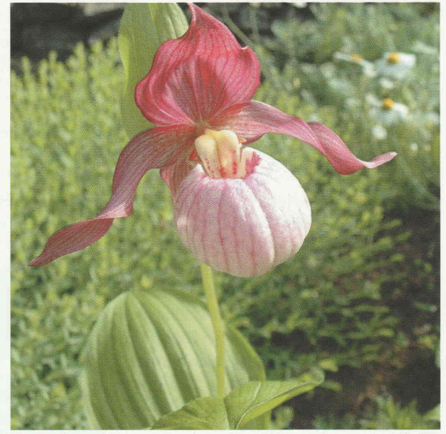
Gisela (parviflrum x macranthos)