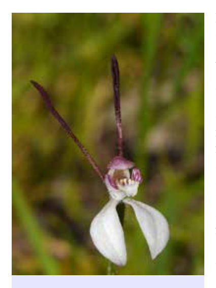
Fig. 7: Leptoceras menziesii