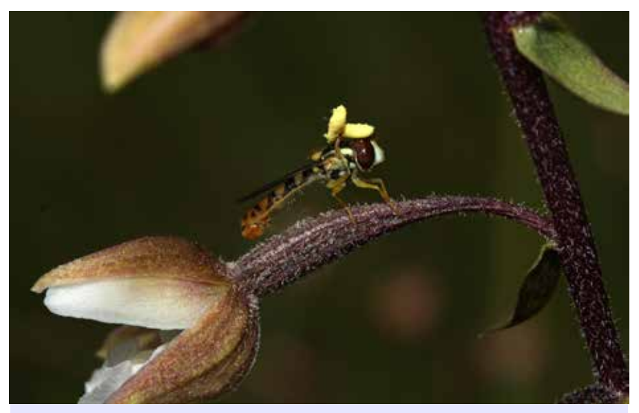
Fig 4: The hoverfly attempts to groom pollinia from its thorax, but is unable to do so