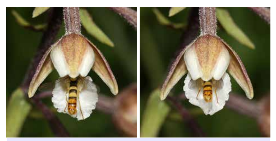
Fig.1 (left): Epichile hinged down Fig 2 (right): Epichile hinged up