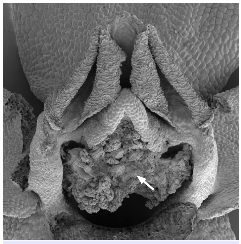
Fig. 8: Scanning electron micrograph of the stigmatic 'plug' (arrowed) that aids self-pollination in the buds of Platanthera hyperborea .