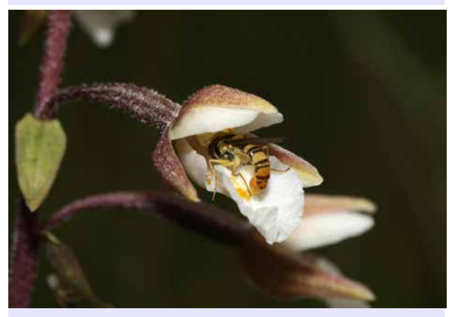
Fig 3: Hoverfly with weight partly transferred to the hypochile: epichile hinged up. The insect's middle legs are inserted round the front edge of the epichile, perhaps assisting the forward and upward projection of the insect as the epichile hinges upwards.