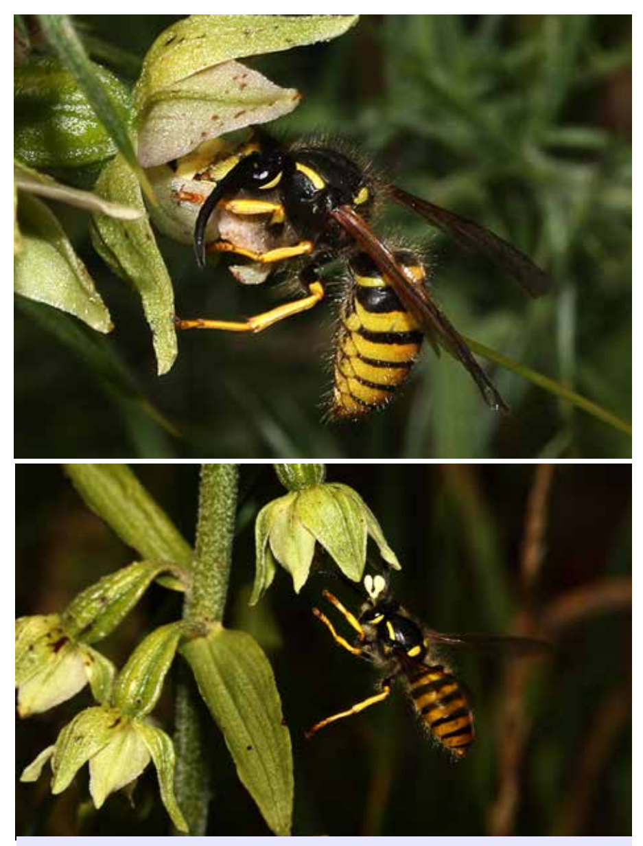
Fig 6 (top): Dolichovespula sylvestris male taking nectar from Broad-leaved Helleborine.

Fig 7 (bottom): Dolichovespula sylvestris worker leaving Broad-leaved Helleborine flower with pollinia attached to its clypeus.