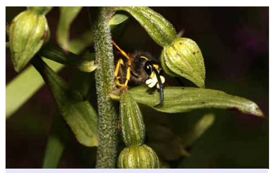
Fig 8: Dolichovespula sp. male with multiple pollinia on its clypeus. Note the long antennae of the male. (Figs 6-8 from Swanton Novers Great Wood, 6<sup>th</sup> August 2012)