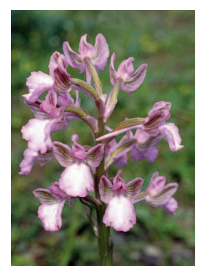
Orchis boryi

In 2002 we were in the Gargano region of south-east Italy. Driving through the hills He was smitten with an urgent need for a 'comfort stop', so screeched to a halt and darted through a gap in the wall. When comfortable again, He noticed a huge orange teddy-bear, at least four feet tall, lying by the wall. In addition, there was the most wonderful collection of typical Gargano orchids scattered over the neglected meadow, including some superb Ophrys sipontensis . Thinking that some poor child might have lost the teddy, He kindly leaned it up against the wall by the road. In no time at all, the "Orange Teddy site" was the talk of the Gargano!