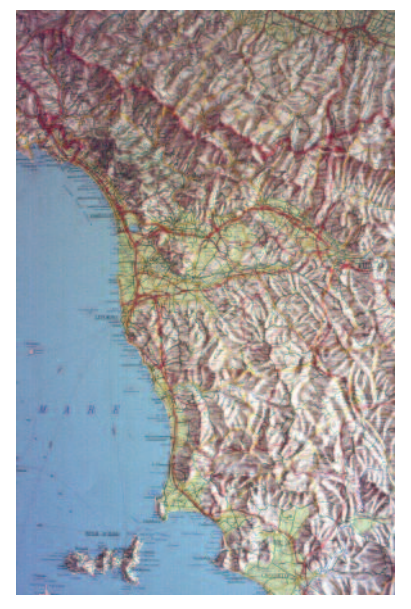
Figure 1. Three-dimensional topographic map of western Tuscany.

Rather than head directly northward, we immediately indulged in a modest diversion, heading west a short distance along the north coast of the Piombino peninsula. Our primary objective of this afternoon's diversion was to view two closely-spaced sets of Etruscan tombs in the newly-founded archaeological park. The first group, set in maritime grassland, resembled Neolithic chambered tombs, and restoration of their turf roofs provided our only Tuscan record of Serapias vomeracea , here growing alongside S. parviflora . The second group of tombs, cut into the walls of an Etruscan sandstone quarry, were set in mature woodland, and so were overlooked by a solitary Limodorum abortivum that possessed unusually widely open flowers. We