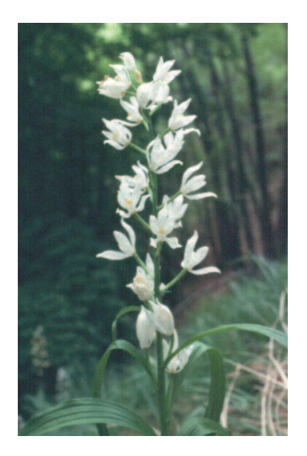
Figure 4. Monumental plants of Cephalanthera longifolia in mixed woodland below Monte Borla, Apuane.

atrorubens. Other notable elements of this alpine flora were various Narcissus, Helleborus, Polygonatum, Anemone, Hepatica, Aristolochia with Aquilegia in the woods, and Gentiana and Polygala in more open areas.