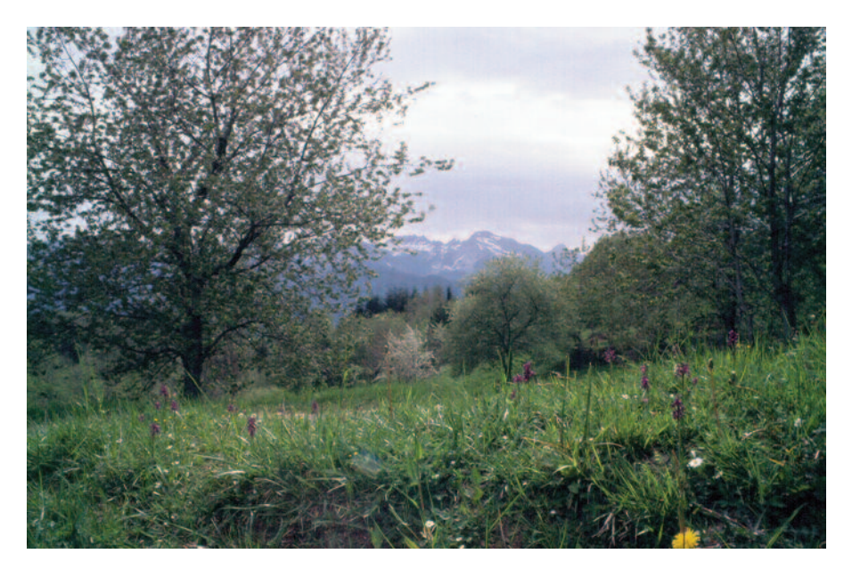
Figure 2. The snow-capped Apuan Alps, viewed southwest from the Orecchiellan Hills across a dark-flowered population of Anacamptis morio .

hardly does them justice: over the last three millennia entire mountain tops have been quarried away, leaving glistening debris slopes that, when viewed from a distance, are difficult to distinguish from the persistent snow patches that also adorn the higher peaks (Fig. 2).