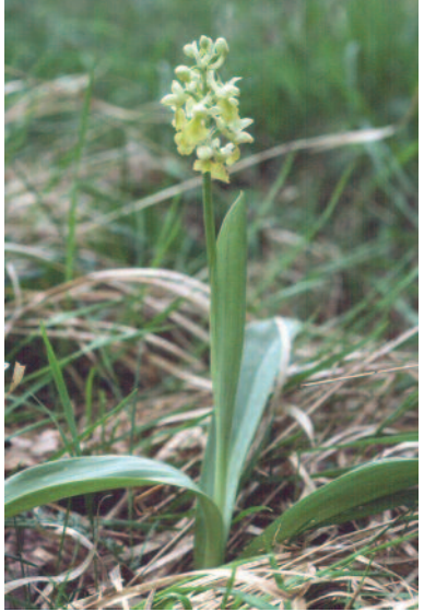
Figure 3. Orchis pallens in open pinewoods at Passo Vestito, Apuane.

Two localities proved especially memorable. The first, Passo Vestito (immediately north of Monte Altissimo), was reached by walking northward on a hiking trail from the east end of the unfortunately named Gobbie tunnel. Reaching 1040 m, this is the highest point attained by a metalled road in the southern half of the Apuane. Although only a mountain goat or a madman would follow the marked trail over the edge of the sheer and apparently bottom-less cliffs, both the views and the flora were spectacular. Preeminent among the orchids was a small population of Orchis pallens, far more vegetatively robust than the nearby O. pauciflora and further distinguished by its remarkable flowers, which simultaneously manage to appear both bright yellow and bright green (Fig. 3). Orchids yet to flower included putative Dactylorhiza insularis and Epipactis