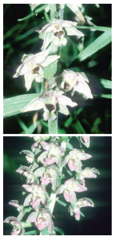
Contrasting colour forms of Epipactis helleborine.

When I first started photographing these orchids, they were a fairly drab green/brown colour, but over the years some have developed a stunning vivid pink/purple colouration. About 10 years ago there was one growing out in the open on its own, and this was very pale, standing out from all of the others. Being fascinated by this one I returned later, and pushed a knitting needle into the soil alongside of the plant; that explains why some of my wife's knitting, has been done on two different sized needles! The following year I returned to find the knitting needle and the pale plant, but this time with a GPS to take readings. I found the needle with no problem, but the plant had nothing like the colouration of the previous year. This led me to look closely at all of the other plants, and it seemed to me that they all had varied in colour from the previous year.