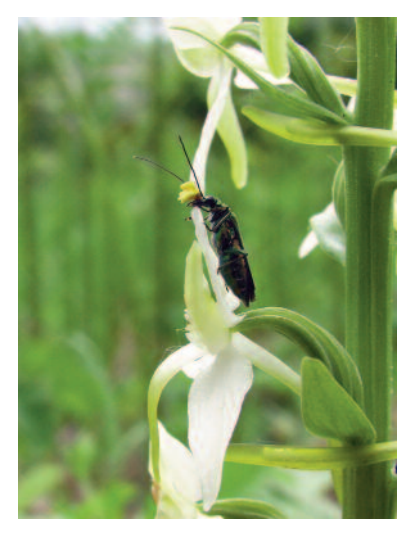
Flower Beetle, Oedemera nobilis with pollinia of Platanthera bifolia.

Then, as I crawled towards the next flower spike, I saw it. Sitting on an orchid flower, with its emerald iridescence glistening in the sun, was one of the most attractive beetles I had ever seen. Subsequent delvings in the insect book suggested it was a female Flower Beetle of the Oedemera nobilis brand. Had I been a male of that species (easy to tell which is which - the males have bulging thigh muscles!) I would have found her beauty irresistible. But there was more to it than that - her front end was plastered with orchid pollinia!