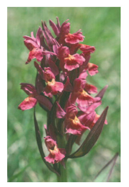
Figure 9. Brick-red Dactylorhiza sambucina in moist alpine meadows by Rifugio Belvedere, Monte Borla, Apuane.

The northeast slopes of the Apuane are shallower and less rugged, providing a gradual transition to the more pastoral landscapes of the Garfagnana Valley and the Orecchiellan mountains beyond. During our brief visit to the Orecchielli we explored the alpine pastures and open chestnut woods adjacent to Rifugio Isera (1100 m) at the foot of Pania di Corfino (1603 m), the rockiest of the limestone peaks encompassed by this smaller montane national park. Most visually striking were drifts of pristine wine-purple Anacamptis morio, though more interesting to the specialist were a large and precocious Dactylorhiza viridis in the meadows and a modest (but treasured) population of D. sambucina nearby in a small woodland reserve.