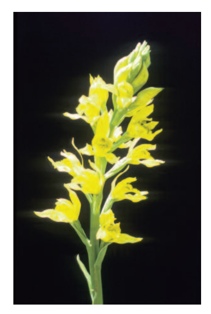
Flowering spike of Chloraea chrysantha.

The effort of flowering and production of seed had completely drained the basal leaf rosettes, which simply dried off and were easily removed. I began to suspect that the plant was monocarpic and feared the worst. The compost was kept moist, and in early autumn a small green bud appeared. Over the next few months more shoots appeared and there are now a total of five rosettes. The largest rosette has over ten leaves and is nearly as big as the plant was when it went into flowering mode. As I have not dared to disturb the pot, I do not know whether or not the rosettes have independent root stock (as Dactylorhiza) or remain conjoined.