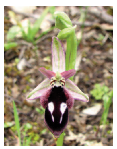
Ophrys reinholdii