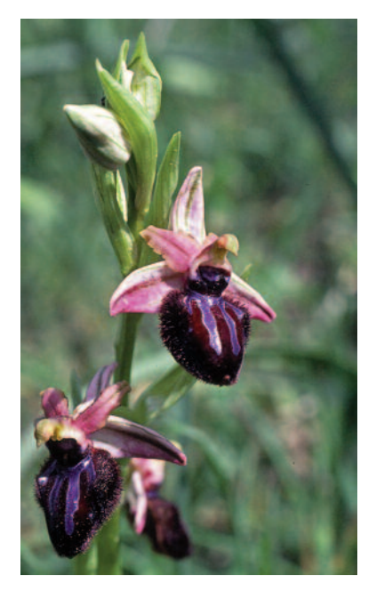
Ophrys sipontensis