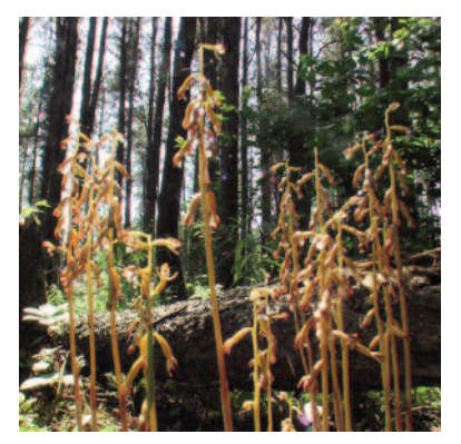
Corallorhiza maculata