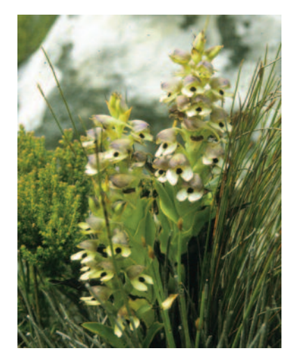
Disa cornuta on Table Mountain

Anyone interested in seeing and photographing Disas in the wild would do well to visit South Africa between the middle of January and mid - February. It is possible to see Disa uniflora, D. ferruginea and D. graminifolia at the same time on Table Mountain. D. graminifolia is a stunning plant notable for its blue coloured flowers. Several other species would also be possible, including D. cornuta. There are many ways up, including walking Skeleton Gorge from up Kirstenbosch Botanic Garden and taking a ride up on the cable car. It is possible to purchase a map showing the mountain's footpaths, and I would be happy to advise anyone wishing to visit South Africa to witness these beautiful orchids