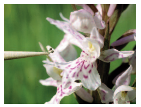
Dactylorhiza fuchsii pollinia on a cocktail stick

Within the pollinia, the pollen grains are usually held together by threads; in many species these threads extend at the front end to form a "caudicle" - a flexible string joining each pollinium to the rostellum. The rostellum is a factory for superglue! Its surface is covered by a thin membrane which, when touched, ruptures and releases