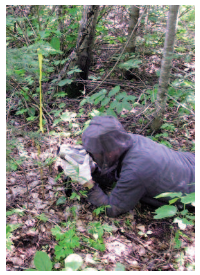
Mosquito-protected Graham Giles photographs Corallorhiza maculata

ta, together with the ubiquitous Platanthera obtusata (Blunt-Leaved Rein Orchid), and one emerging Spiranthes romanzoffiana .