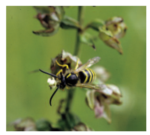
Wasp with pollinia on Epipactis helleborine

The rather unspectacular flowers of Twayblade ( Listera ovata ) do not offer the long-range attraction potential of all the species looked at earlier, but they are reputed to be perfumed. Many species of smaller flies