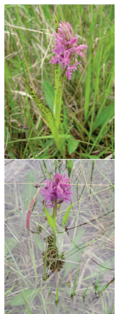
Dactylorhiza incarnata subsp. cruenta

mountain, we are fairly certain that we have also seen a specimen of the Narrow Leaved Marsh orchid, D. traunsteinerioides , as well as the much more numerous Common Spotted Orchid, D. fuchsii (both the usual type and the white variant, okellyi ).