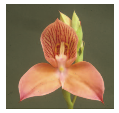
Disa Unikewbett 'Purple Man' × Disa Kewbett 'Shot Silk'