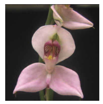
Disa venosa