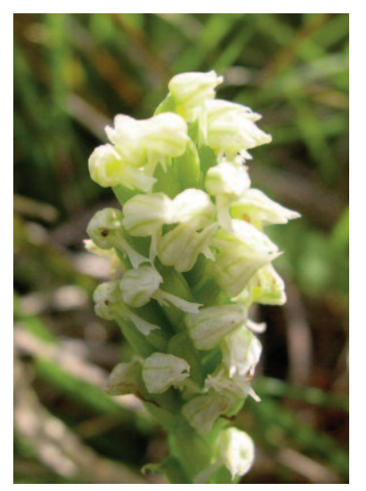
Dense Flowered Orchid, Neotinea maculata