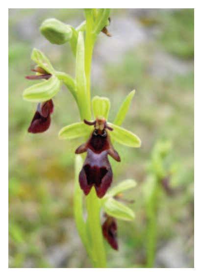
Fly Orchid, Ophrys insectifera

thinly scattered all around Mullagh More, preferring grassy areas to pavement. We have recorded them in their prime in the last week of May, but another year they were just about over by then. Small White Orchids ( Pseudorchis albida ) are recorded in the area, but we haven't seen any. By the end of May, Heath Spotted Orchids ( Dactylorhiza maculata) tend to be the "default" species, along with plenty of Twayblades ( Listera ovata), occasional Fly Orchids ( Ophrys insectifera) and just the odd Frog Orchid ( Dactylorhiza ( Coeloglossum ) viridis), with Lesser Butterfly Orchids ( Platanthera bifo lia ) coming along in early June.