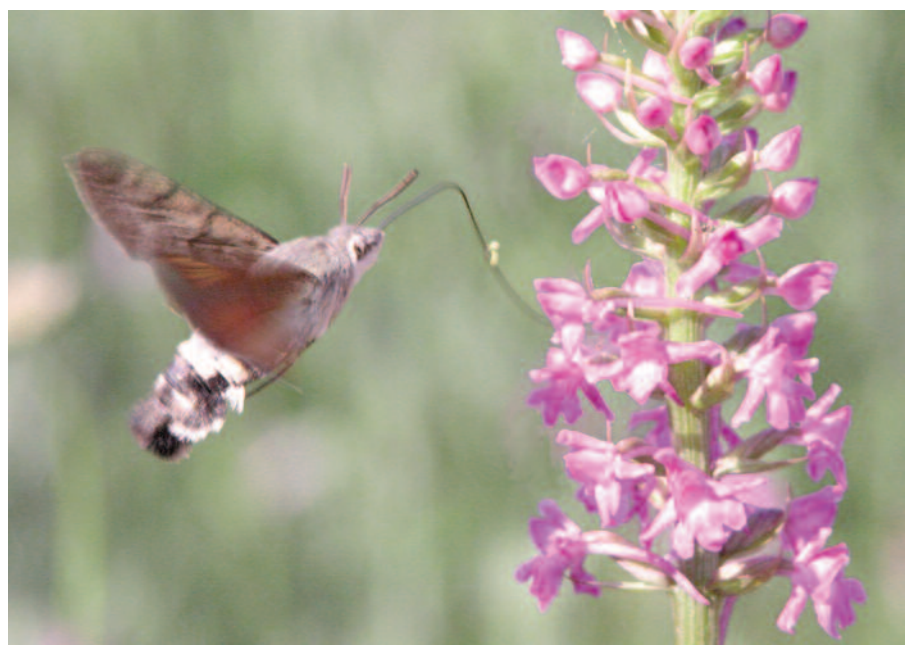
Hummingbird Hawkmoth visiting Gymnadenia conopsea

Fragrant Orchids ( Gymnadenia species) adopt a similar strategy, having long spurs, strong perfume and copious nectar, but their smaller pink flowers tend to attract day-flying moths. Bill Temple's magnificent picture of a Hummingbird Hawk-moth in action illustrates exactly how it all works.