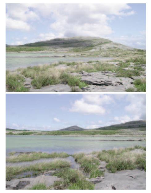
Views of Mullagh More and Lough Gealain

Traditionally, cattle have grazed Mullagh More during the winter months (when the copious amount of rainfall ensures they don't go thirsty). Then, they are taken down to more lowland - and increasingly "improved" - pastures in the summer, where water can be easily laid on. This "upside down" grazing arrangement (compared to that in most of the UK) ensures that the limestone pavement and its grassy terraces