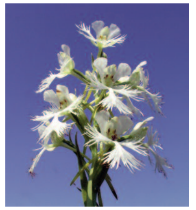
Western Prairie Fringed Orchid, Platanthera praeclara

The fourth North American Native Orchid Conference was held in July 2005. I attended the Conference in Manitoba with my HOS friends from the U.K., Graham Giles and Simon Andrew. We travelled together from the airport to the meeting venue at St Benedict's, a monastery on the Red River just to the north of Winnipeg. It was to be our home for the next few days and things got off to a good start, meeting our old friends and reminiscing about previous adventures. On the first day most of the lectures were about the Western Prairie Fringed Orchid ( Platanthera praeclara ) - a rare plant only found in the central states of the USA and Manitoba, Canada.