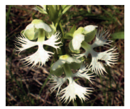
Western Prairie Fringed Orchid Platanthera praeclara