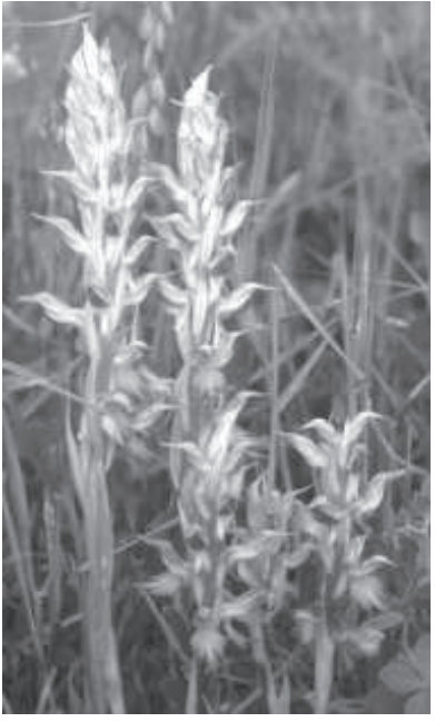
Orchis sancta

For the last afternoon we ventured east once more to the Pirgos area, and stopped on the main road near a honey farm. Here again we found a familiar orchid, Ophrys apifera , and