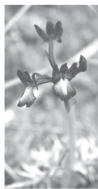
Orchis laxiflora

O. sitiaca and O. sicula with its lovely yellow-edged lip. These orchids were flourishing on some of the driest parts of the hillside, but in the dips where vegetation was a bit lusher and greener Anacamptis pyrami dalis was common. We found one hybrid between this species and Orchis coriophora ssp fragrans , known as Anacamptorchis simorrensis , a cross that sits more comfortably in Richard Bateman's classification than in the traditional one.